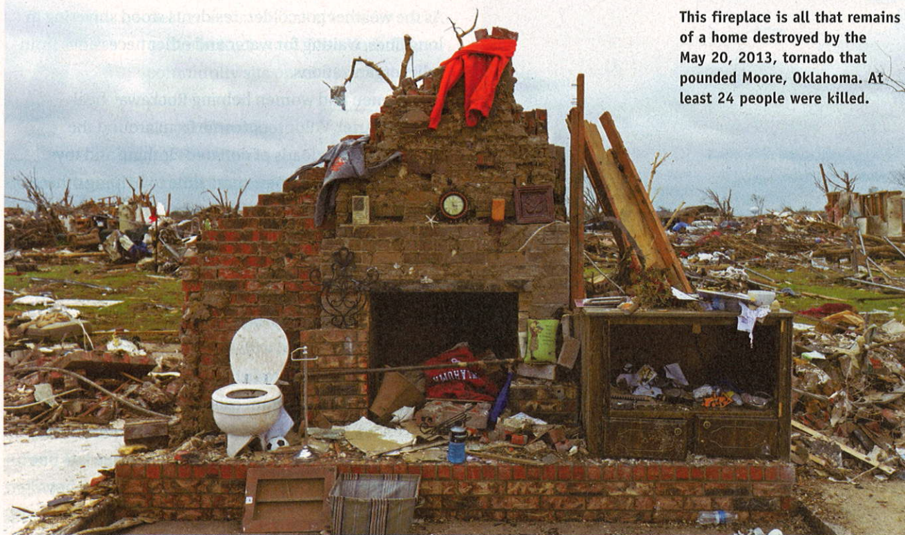
This fireplace is all that remains of a home destroyed by the May 20, 2013, tornado that pounded Moore, Oklahoma. At least 24 people were killed.